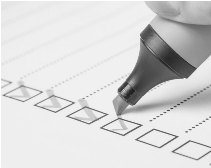
The Individual Supported Plan is mandated by MCCSS and is a requirement to be compliant with legislation.

The Individual Support Plan provides persons with an opportunity to work one on one with a coach to identify an annual "big goal" that should be accomplished within the period of one year. The mandate of the plan is to encourage, sustain and promote self-determination and independence and to work together toward achieving 100%.